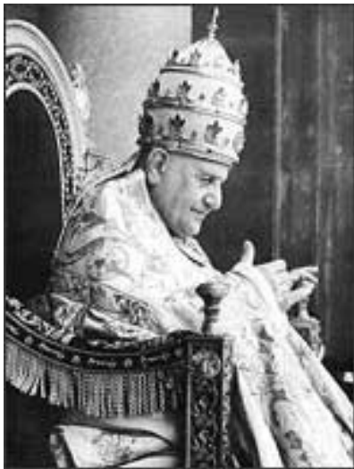
"Good Pope" John XXIII (Pope from 1958 to 1963).

The General at that time was Jean-Baptiste Janssens. Under orders from his General, Pope John XXIII inaugurated the Trojan horse Ecumenical Movement or Vatican Council II.