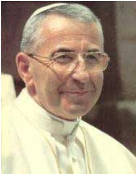
Pope John Paul I (1912-1979) was Pope for 33 days only.

John Paul I was Pope for 33 days only: from August 26, 1978 to September 29, 1978. Like his predecessor, Pope Paul IV, he disliked the Trojan horse Ecumenical Movement and Liberation Theology.