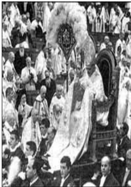
Pope Paul VI (1897-1978). Pope from 1963 to 1978.