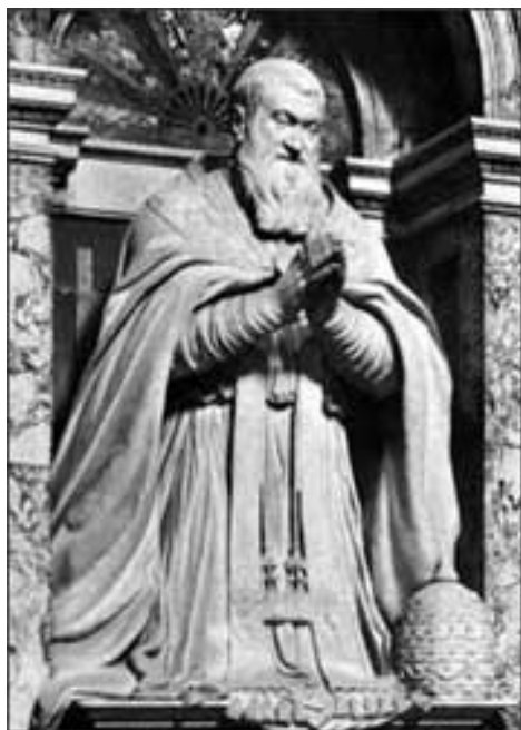
Pope Sixtus V (Pope from 1585 to 1590).

If we go back in history to the time of Don Borgia, we will find that most of the White Popes were killed or had an early demise because they tried to change or abolish the Jesuit Order. One Pope, Sixtus V, just wanted to change the name of the Society from the Society of Jesus to "Ignatine Order." That particular Pope died shortly thereafter: