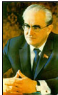
Yuri Andropov (1914-1984). President of the USSR from 1982 to 1984.